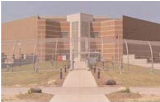
The Ohio State Penitentiary is the state’s only supermax prison. It’s home to Ohio’s death row.